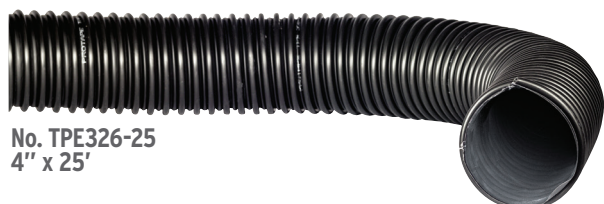
No. TPE326-25 4" x 25'